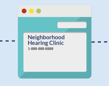
Clinics with strong search engine presence and prominent profiles on our site catch her eye first.

Upgrade your membership today to differentiate your office from your competition.